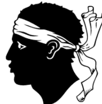
A Moor; the official emblem of the Corsican nation

The Vermentinu (1,525 acres) also known as Malvasia , produces dry white wines of very high quality. It is big and strong on the palate and often have a high alcohol content. It is light with yellowy-green reflections with a nose of flowers, apples and almonds. These indigenous varieties are sometimes combined with continental ones such as Chardonnay, Pinot Noir, Grenache and Cinsault.