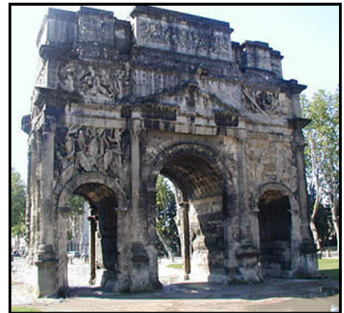
Triumphal Arch in Orange

Viognier is highly aromatic, with a nose of peach, apricot, and violets. It has a mineral mouth with more peach fruit and moderate acidity. Pale pink-gold color. Viognier is grown in the Northern Rhone valley, and reaches its peak in the appellations of Condrieu and Chateau Grillet.